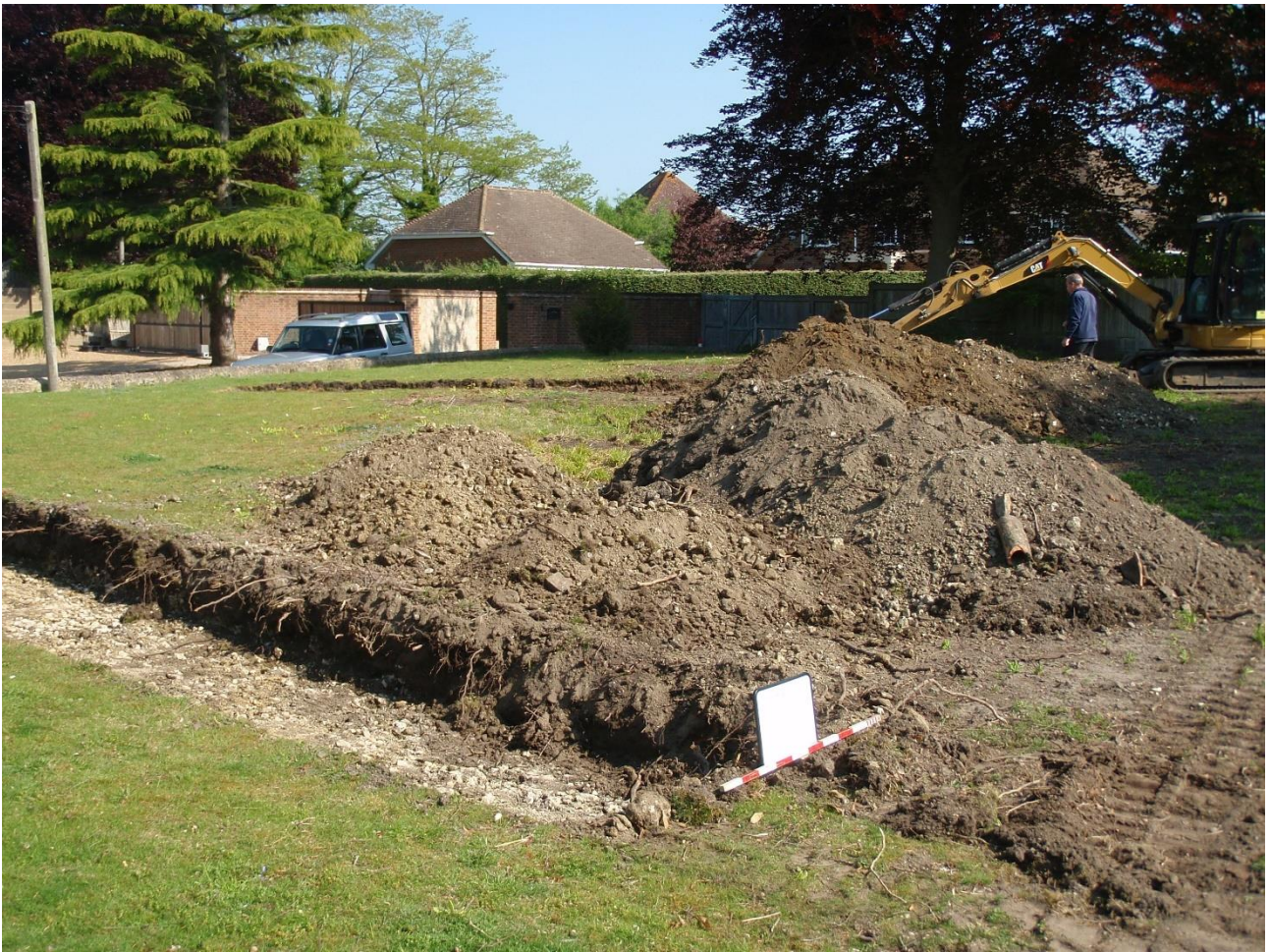
Plates 1 & 2 (below). Trench 1