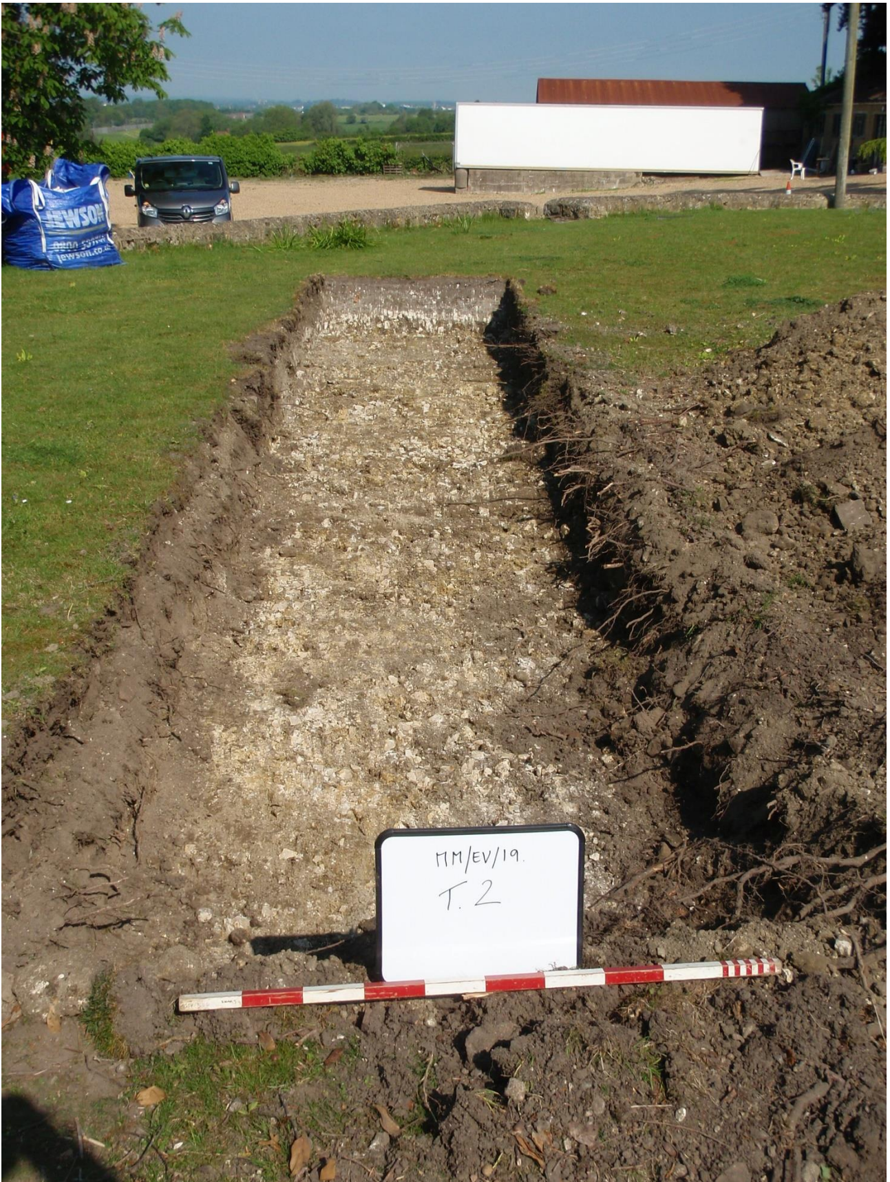
Plate 3. Trench 2