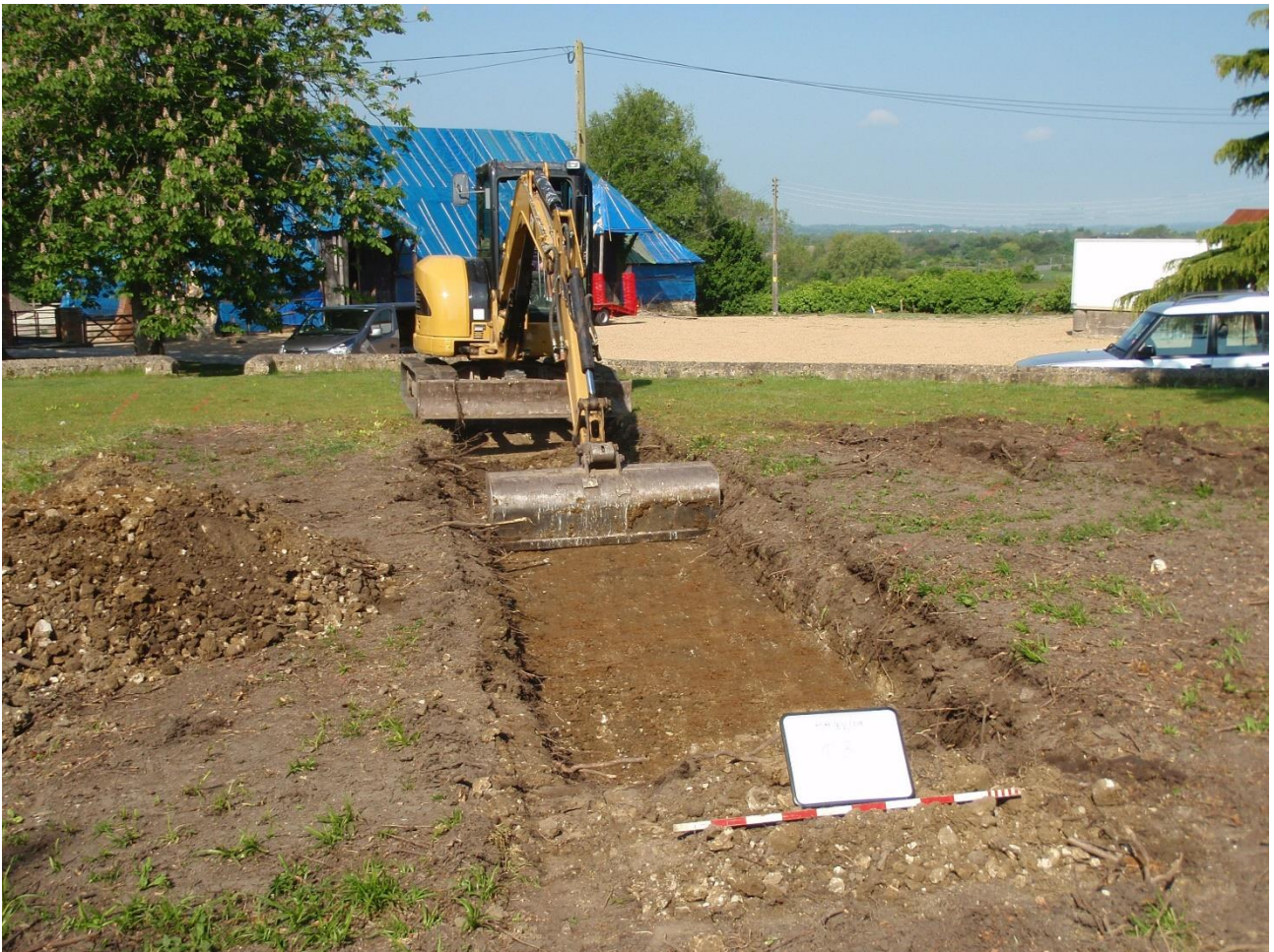
Plates 4 & 5. Trench 3